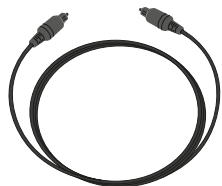
Optical connection cable (S/PDIF)