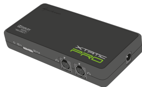
Sound Control Unit (SCU)