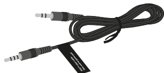
PS4™ chat cable